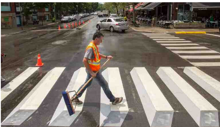
3D pedestrian crossing road marking