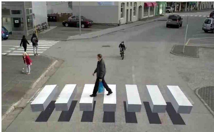
3D pedestrian crossing road marking

The Architectural Centre opposes the proposed introduction of traffic lights at the intersection of Hataitai and Waitoa Roads, Hataitai.