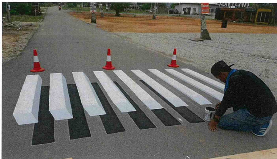
3D pedestrian crossing road marking

We support the suggested removal of car parking, as this will increase visibility of pedestrians. We encourage the installation of bike parking at these locations.